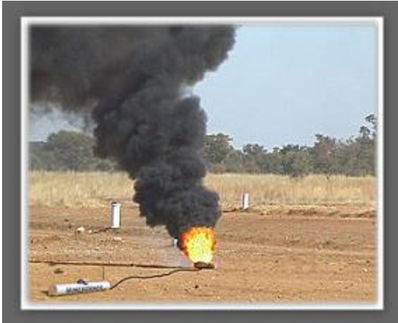
Burning a landmine (MineBurner)

Once found, the most common method of disposing of landmines or UXO is to place an amount of explosive close to the device and destroy it through detonation. This method was originally taught in the early days of humanitarian demining and is referred to in International Mine Action Standards. It does, however, require the provision of explosives and this brings with it the problems associated with importing explosives and moving them around the mine action programme operational locations. Both cost and safety factors have to be taken into consideration.